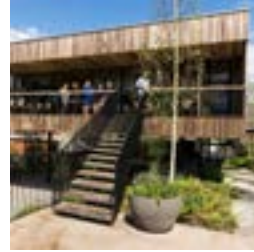
Maggie's Oldham at the Sir Norman Stoller Building, (designed by Alex de Rijke of dRMM Architects, landscaping by Rupert Muldoon), in the grounds of The Royal Oldham Hospital, Oldham, opened in June 2017.