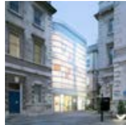
Maggie's Barts (designed by Steven Holl of Steven Holl Architects, landscaping by Darren Hawkes), in the grounds of St Bartholomew's Hospital, East London, opened in December 2017.