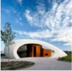
Maggie's Aberdeen at the Elizabeth Montgomerie Building (designed by Snøhetta, landscaping also by Snøhetta), in the grounds of the Aberdeen Royal Infirmary Hospital, Aberdeen, opened in September 2013.