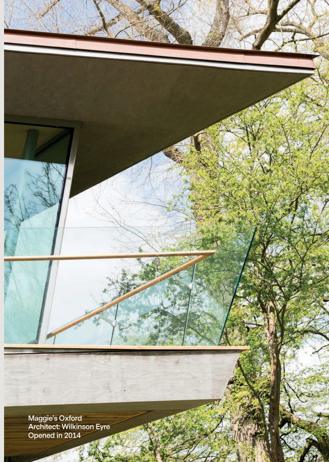
Maggie's Oxford Architect: Wilkinson Eyre Opened in 2014

Parking: Most projects require some parking spaces.