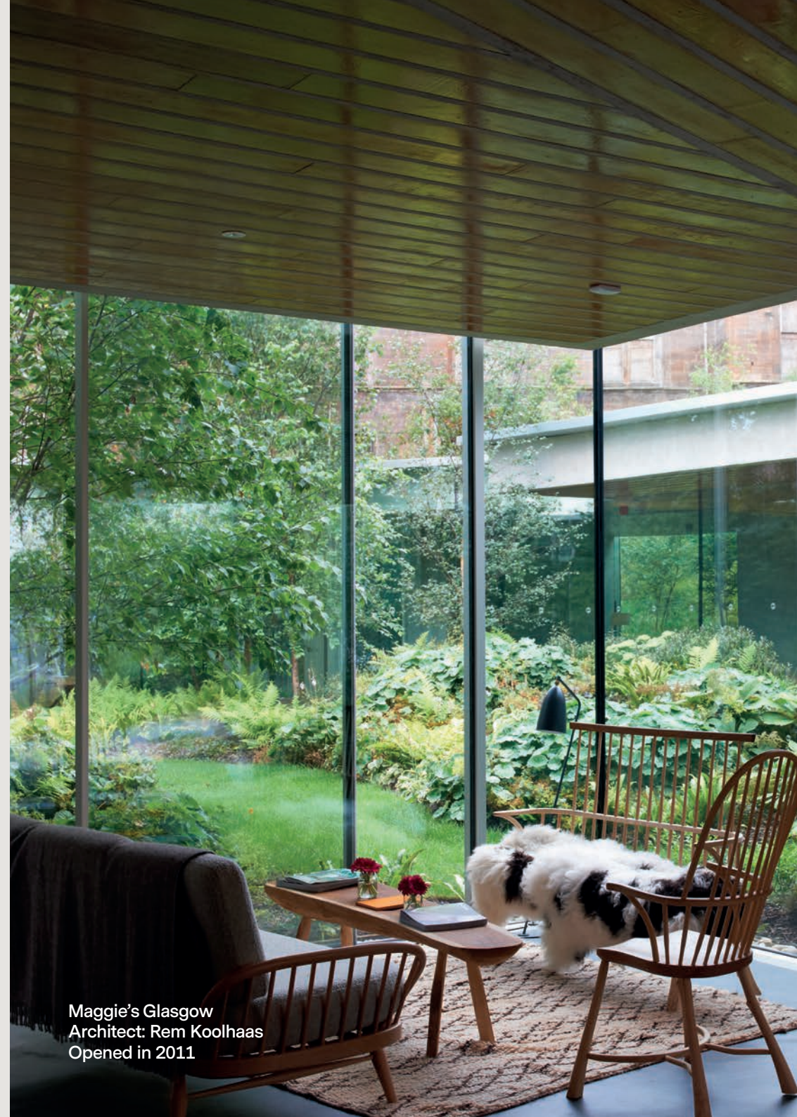
Maggie's Glasgow Architect: Rem Koolhaas Opened in 2011

What we are looking for in our architects and our designers is an imagination and thoughtfulness which looks beyond the normal boundaries of function. We want you to show us how a building and a landscape can do the things we are asking of it (and more) without us having pre-conceived ideas about how you are going to do it.