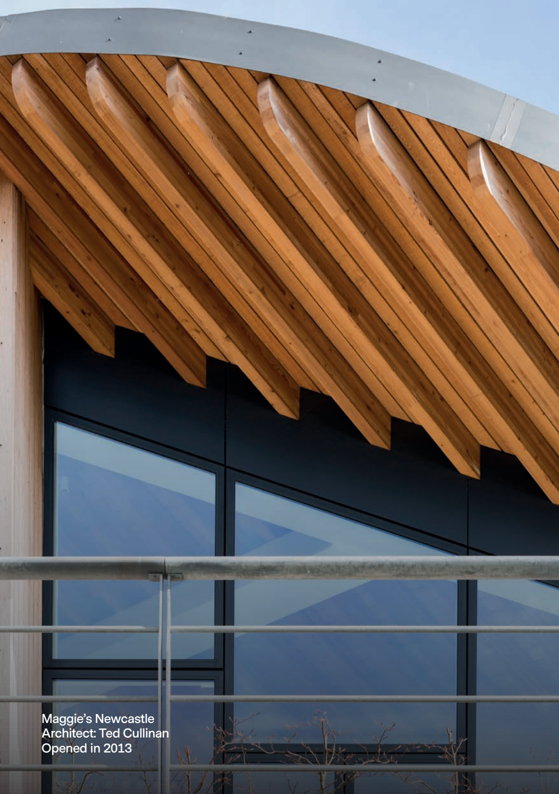
Maggie's Newcastle Architect: Ted Cullinan Opened in 2013